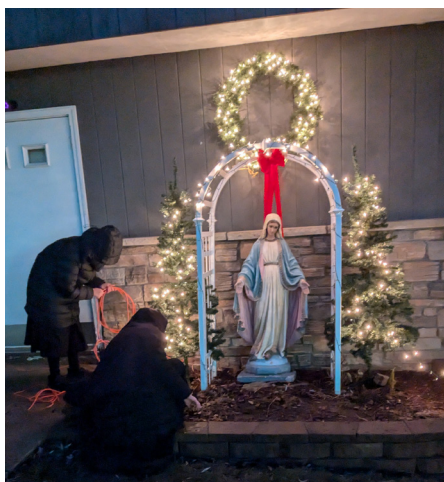
Our Lady of Grace Church, Seneca, Wisconsin