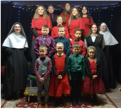
Mary Immaculate Academy, Seneca Wisconsin