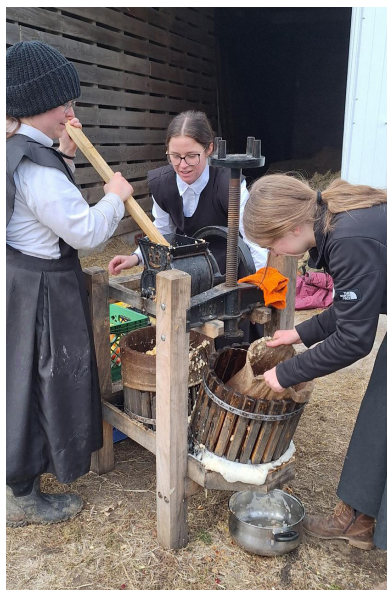
The postulants working hard to make apple cider