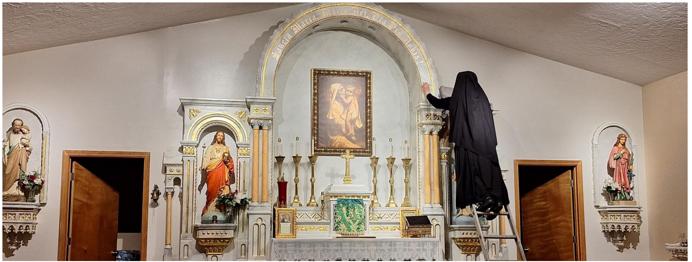
New stenciling above the altar in our chapel: Sancta Maria, Mater Dei, ora pro nobis!