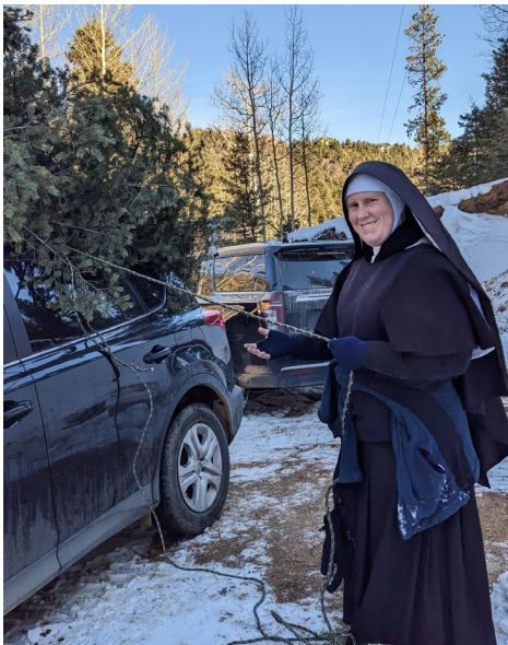
Gathering Christmas trees in the Rocky Mountains