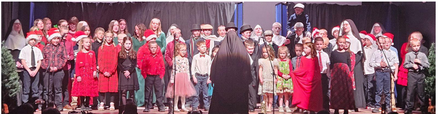
Christmas program at Sacred Heart Academy, Burlington, Colorado