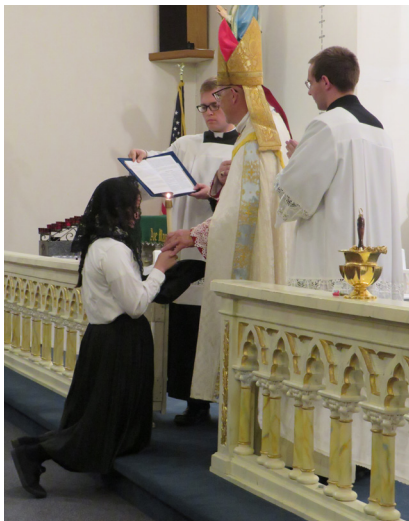
Madison's postulant ceremony