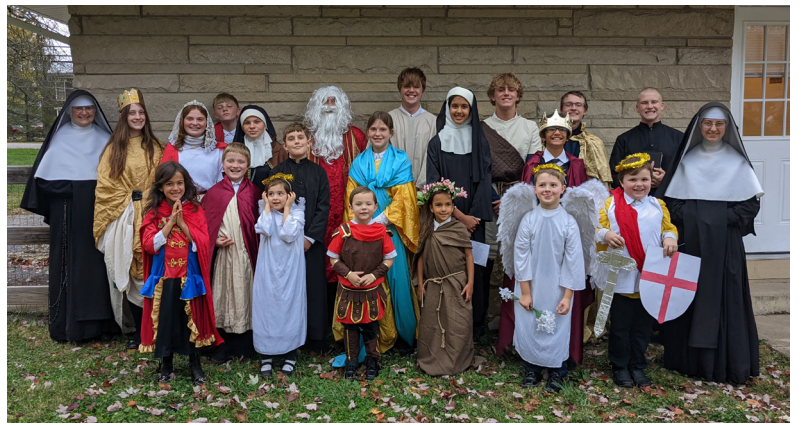
All Saints' Day Party at St. Therese Academy, Lebanon, Ohio