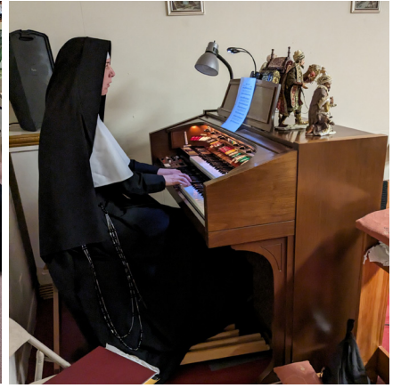
Christmas at St. Benedict's Church, Lacey's Spring, Alabama