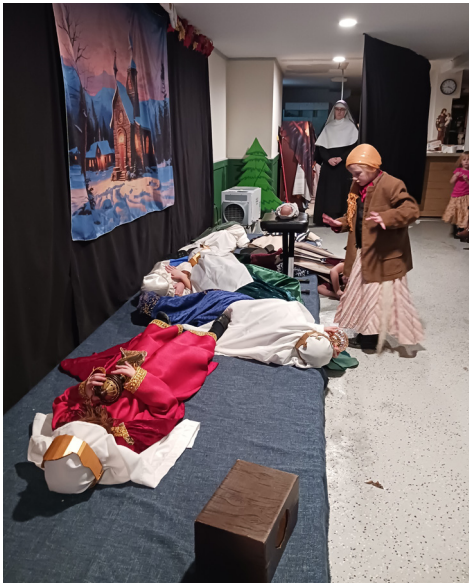
Christmas Play, St. Joseph Academy, Harmony, Minnesota