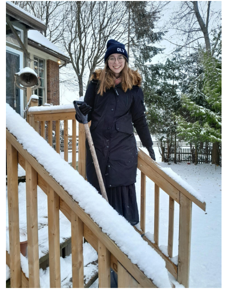
Shoveling snow at Our Lady of Victory Convent and Academy