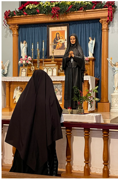
The titular feast of Mother Cabrini Academy in Colorado