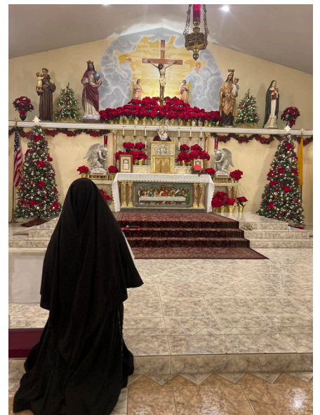
Our Lady of the Sun, El Mirage, Arizona