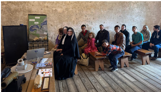
Castillo de San Marcos, St. Augustine, Florida, the oldest masonry fort in the continental U.S.