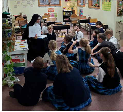
Immaculate Conception Academy, Sartell, Minnesota