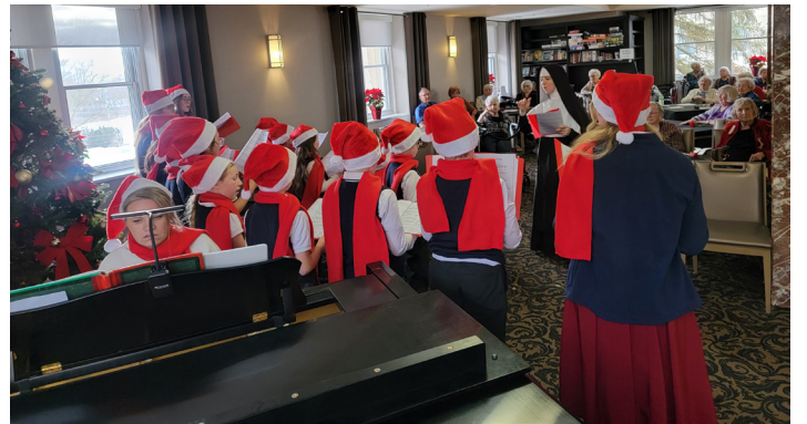
Our Lady of Victory Academy Christmas caroling, Ontario, Canada