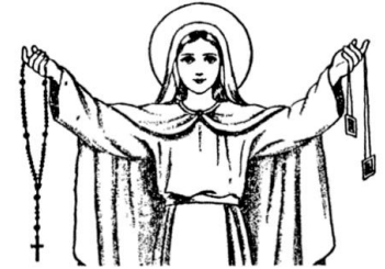
Blessed Virgin Mary to Saint Dominic, "One Day through the Rosary and Scapular I will save the World"