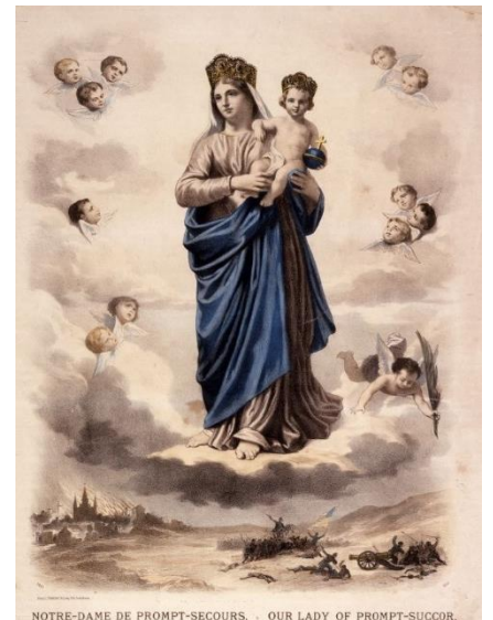
NOTRE-DAME DE PROMPT-SECOURS. OUR LADY OF PROMPT-SUCCESS.

Our Lady of Prompt Succor, Hasten to help us!