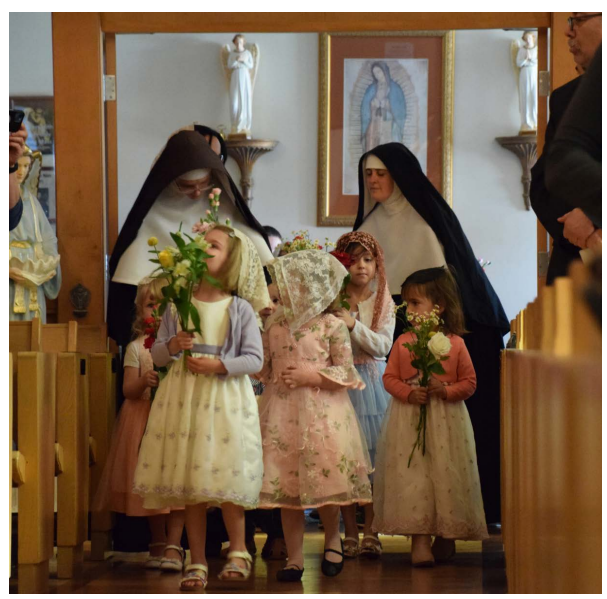
Bringing flowers to Our Lady