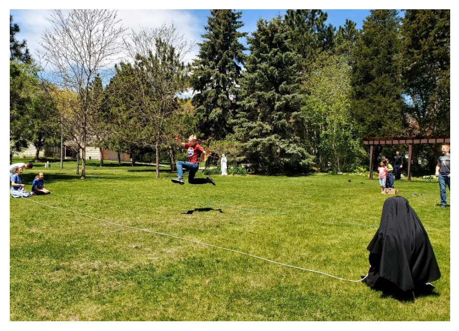
Field Day at Immaculate Conception Academy, Sartell MN