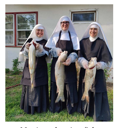
Novices cleaning fish