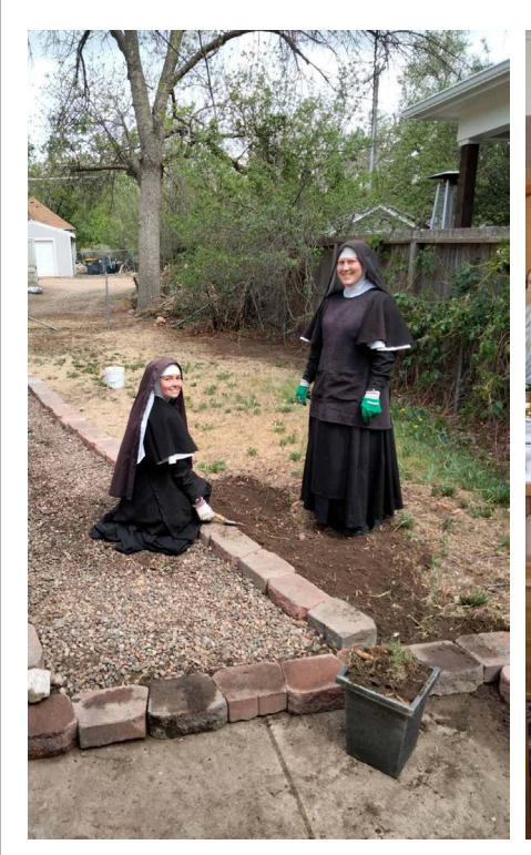
Planting a garden, Colorado Springs, CO