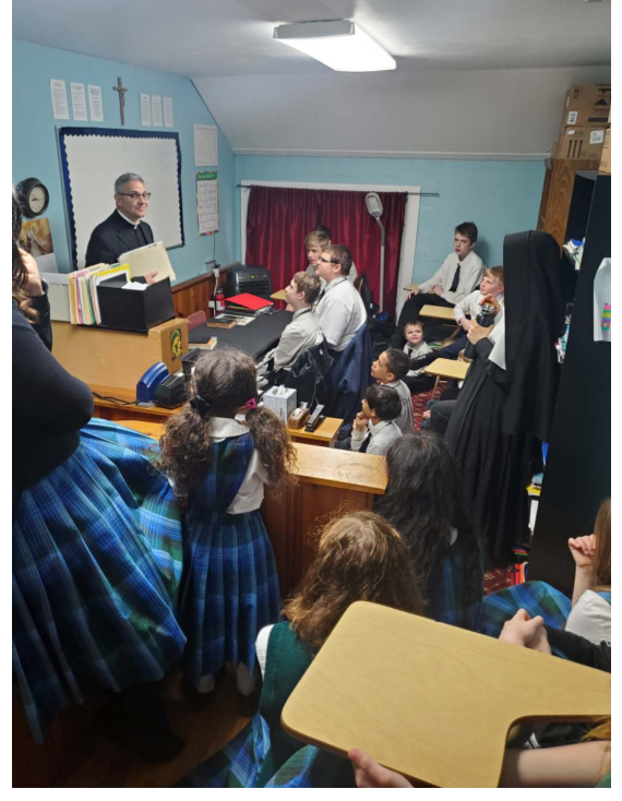
A Visit with Bishop, St. Therese Academy, Lebanon, OH