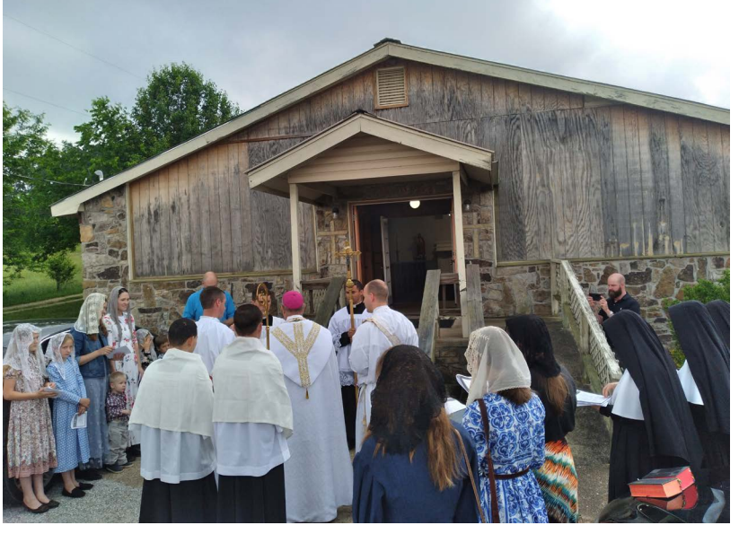
Dedication of Sacred Heart Church, Mountain View, AR