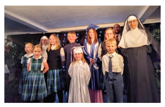
St. Joseph's Academy, Harmony, MN