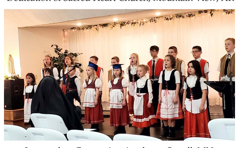
Immaculate Conception Academy, Sartell, MN