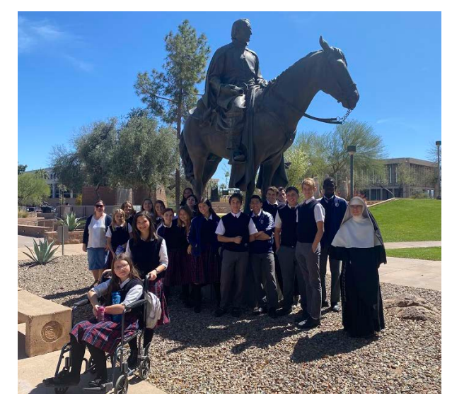
Our Lady of the Sun