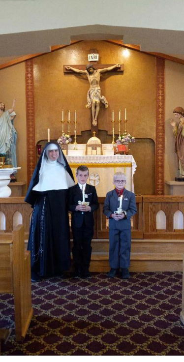
First Holy Communion, Burlington, CO