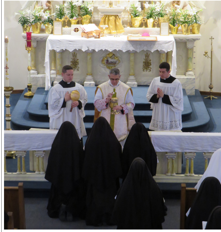
Making Final Profession before the Blessed Sacrament