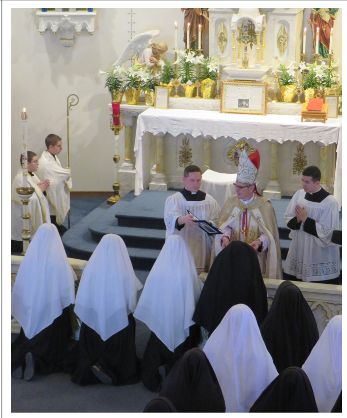
Receiving the black veil on their First Profession of vows