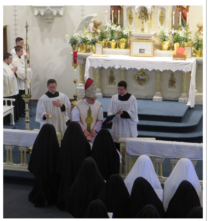
Receiving the gold ring as a sign and pledge of their alliance with their Heavenly Spouse