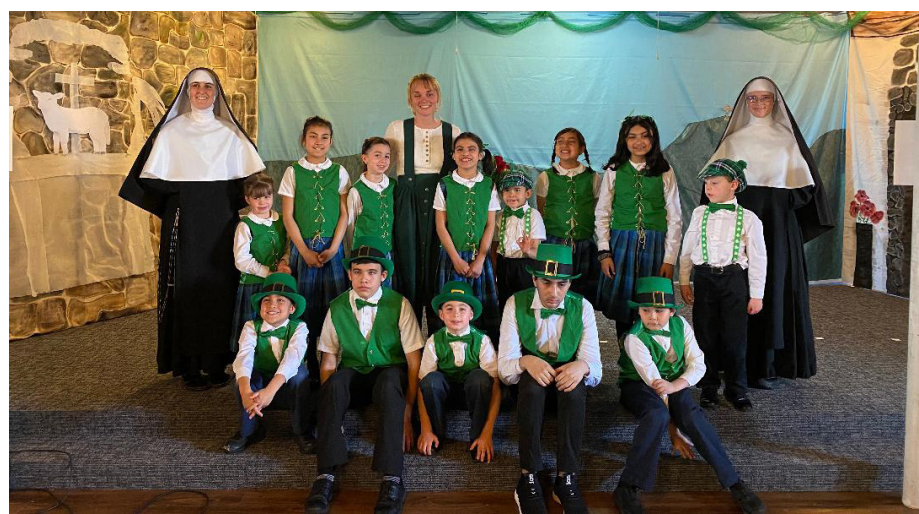
St. Patrick's Day Program in Denver, Colorado