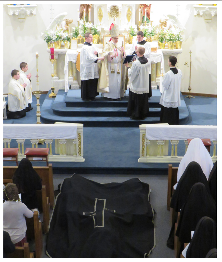
Before making their Final Profession the Sisters are covered with the Pall