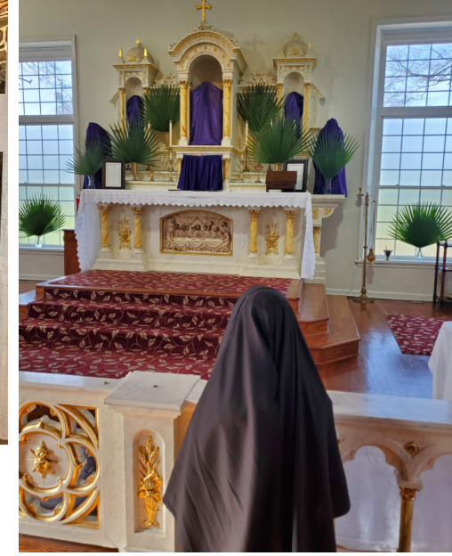
Palm Sunday in Lebanon, OH