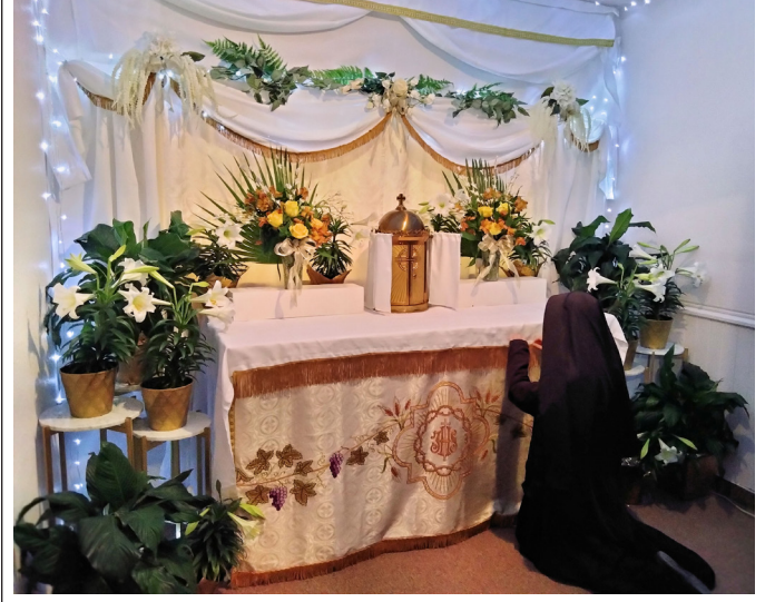
Preparing the Altar of Repose in Harmony, MN