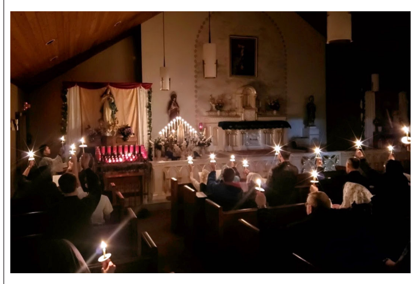
St. Patrick's Day Program in Phoenix, AZ \,