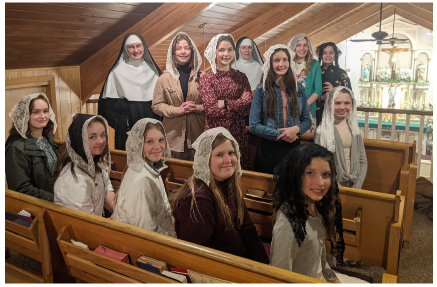
Church Choir in Seneca, Wisconsin (above)

Cutting the hair of the New Novices before the reception of the habit and the white veil (right)