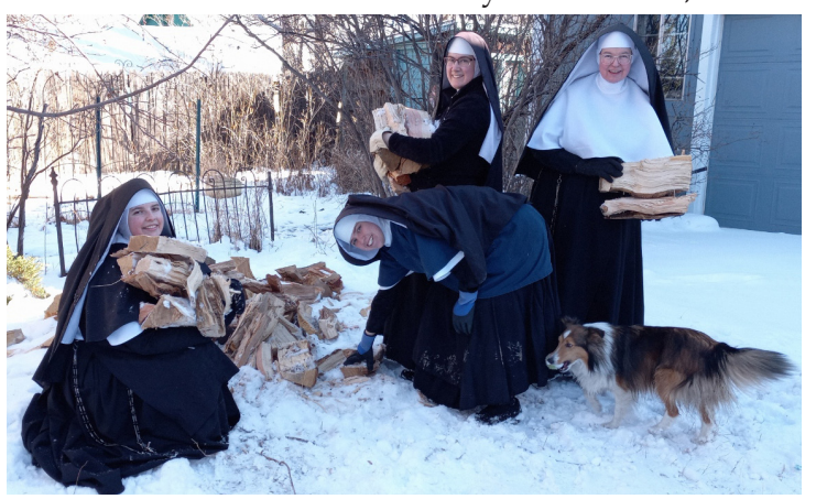
Gathering wood in Burlington, CO