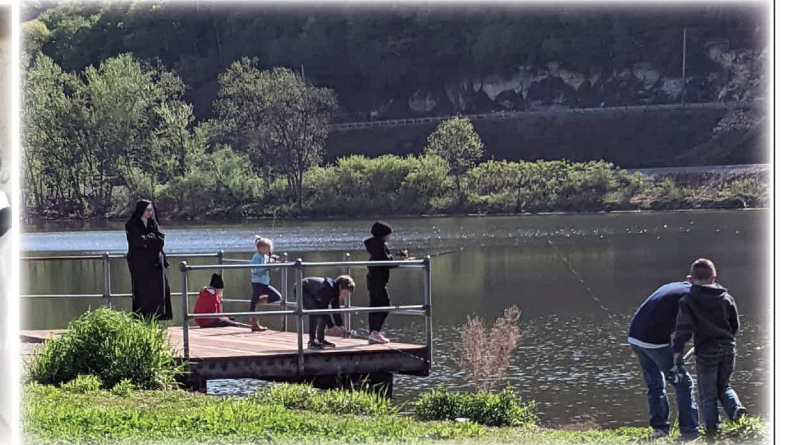
Mary Immaculate Academy, Seneca, WI