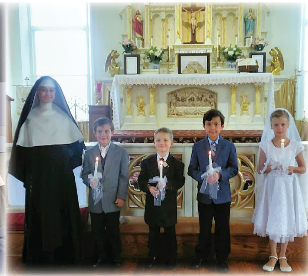
St. Therese Academy - Lebanon, OH