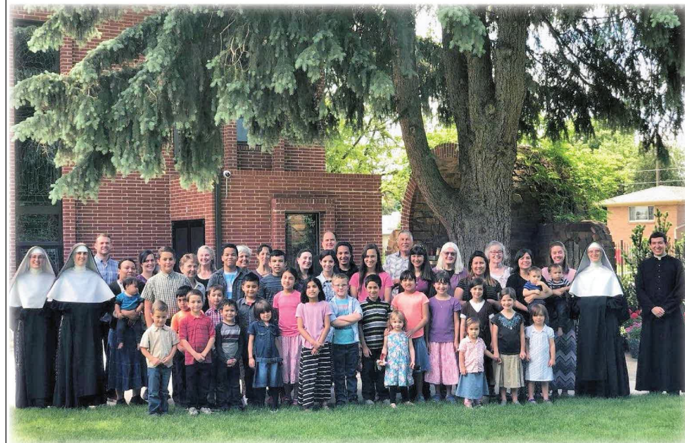
Summer Catechism, Denver, CO