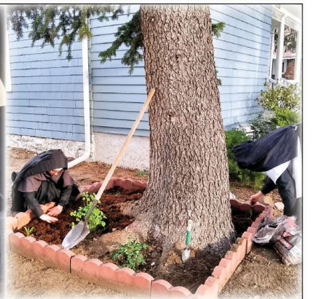
Colorado Springs, CO