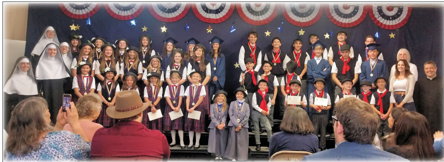
Our Lady of the Sun Academy, Phoenix, AZ