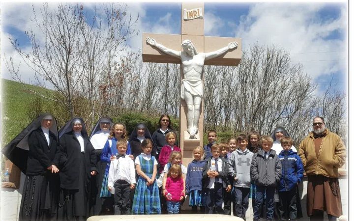
Sacred Heart Academy, Burlington, CO