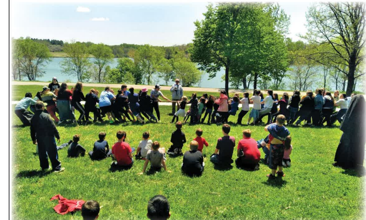
Mater Dei Academy, Omaha, NE