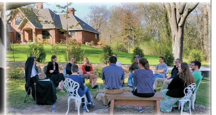
Immaculate Conception Parish, Sartell, MN